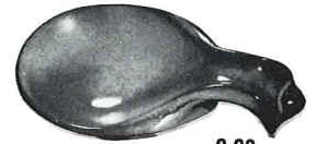
*4Y—6" SPOON HOLDER 3.00