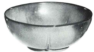
*224—8" ROUND BOWL 6.50