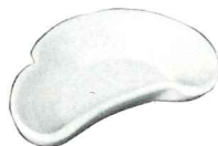
*243—6 1/2" CRESCENT SALAD 2.50