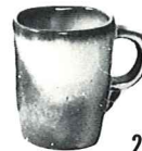
*5CC—5 OZ. TEACUP 2.75