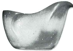
4A—8 OZ. CREAMER 3.25