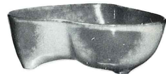
*4N—24 OZ. VEGETABLE 4.75