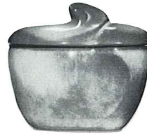
4B—SUGAR WITH LID 5.00