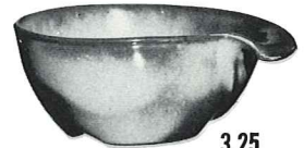
*4X—14 OZ. CEREAL 3.25