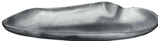
*4P—13" PLATTER 7.75