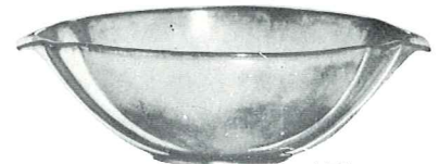
*201—9" BOWL 4.75