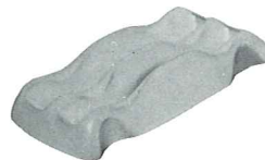
249 TACO HOLDER BOXED 2 PER BOX 10.00 Not Available in Flame