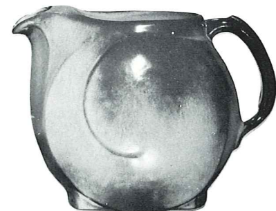
*4D—2 QT. PITCHER 9.25

THIS PAGE AVAILABLE IN PRAIRIE GREEN, DESERT GOLD, BROWN SATIN AND ROBIN EGG BLUE, EXCEPT WHERE NOTED*