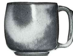
*4M—18 OZ. MUG 4.50